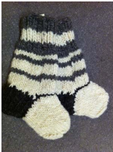
Long Socks Adult Size $80.00