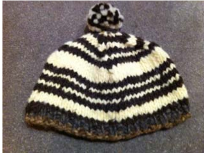
Toques- Adult Size

Cowichan accessories are a great compliment to your sweater purchase, the knitter can match the designs and wool color to make a beautiful set.