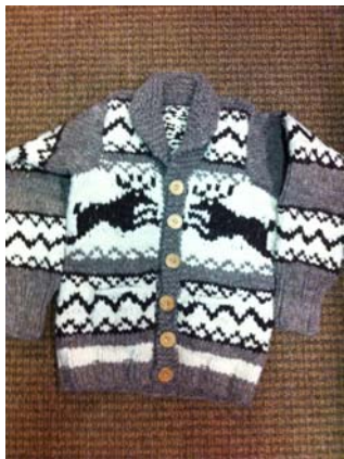
DEER WITH BUTTONS